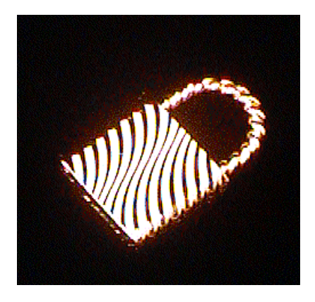
18ct Padlock engine turned with deep gently curving spiral waves which follow around the edges The same principle applied to a different shape with a different pattern design