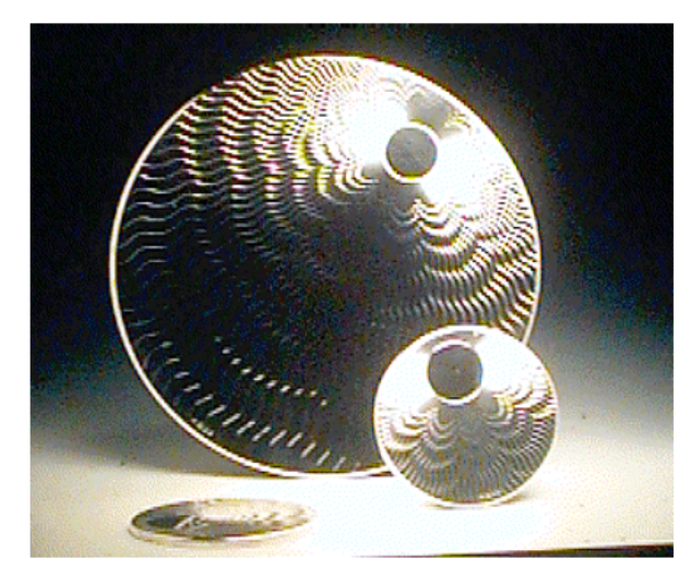
Part of a set of Coasters in silver