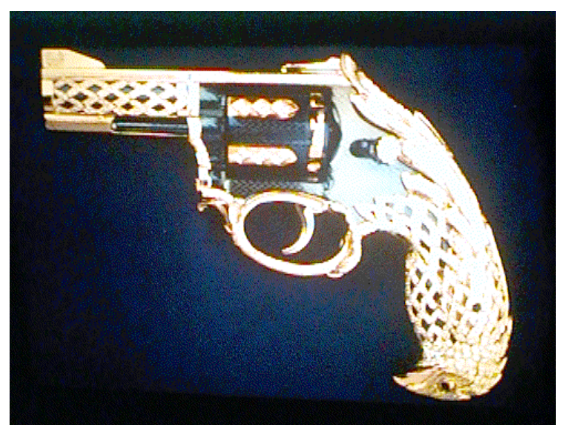
A 38 special with a handle in the shape of a Falcon set with diamonds