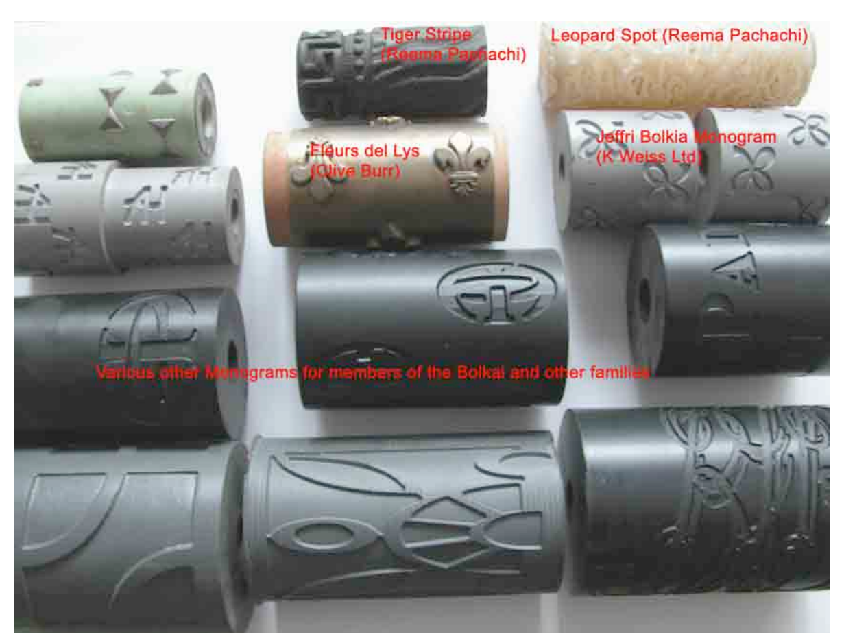
Pattern rollers, mostly made to order for bespoke engine turning designs. The design owners are variously marked where known.