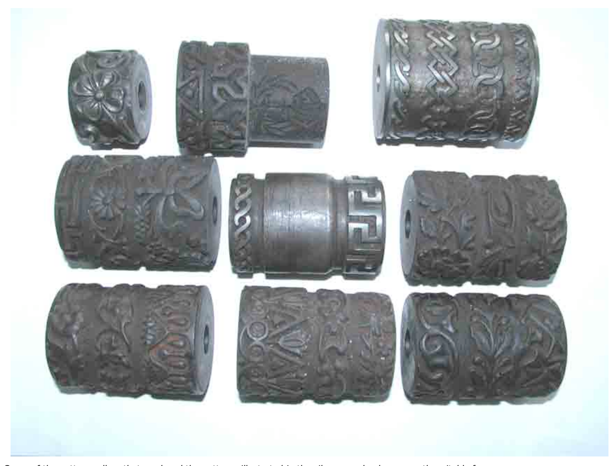
Some of the pattern rollers that produced the patterns illustrated in the silver sample above, mostly suitable for borders and edges.