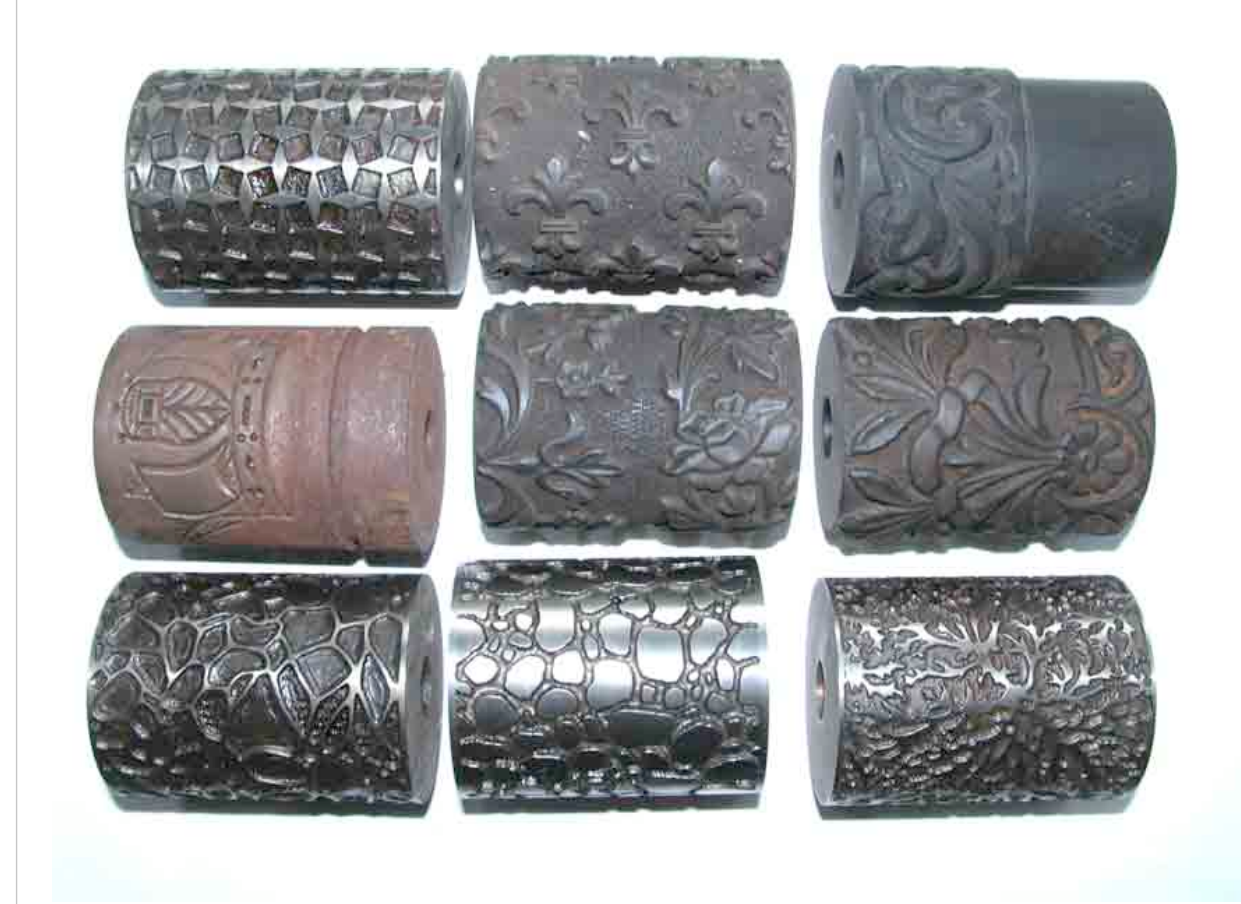
Pattern rollers, mostly with repeating designs or otherwise for general use, rather than borders.