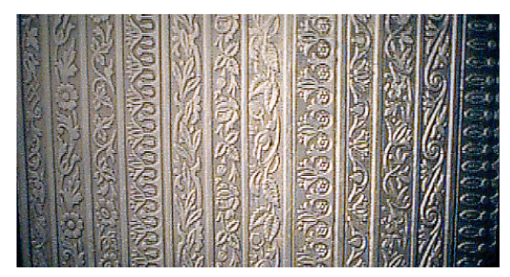
A selection of Brocade Borders cut by hand from master rollers.

A hand operated low relief machine. Master cylinders containing the pattern to be reproduced rotate in relation to the workpiece. Unlike normal engine turning some scaling of the design is possible by varying the gearing of rotation of the cylinder and the movement across it of the stylus in relation to the movement of the work and the traversing of the sliderest. Tremendous skill is required to produce high quality work with this type of machine especially if the work is large.