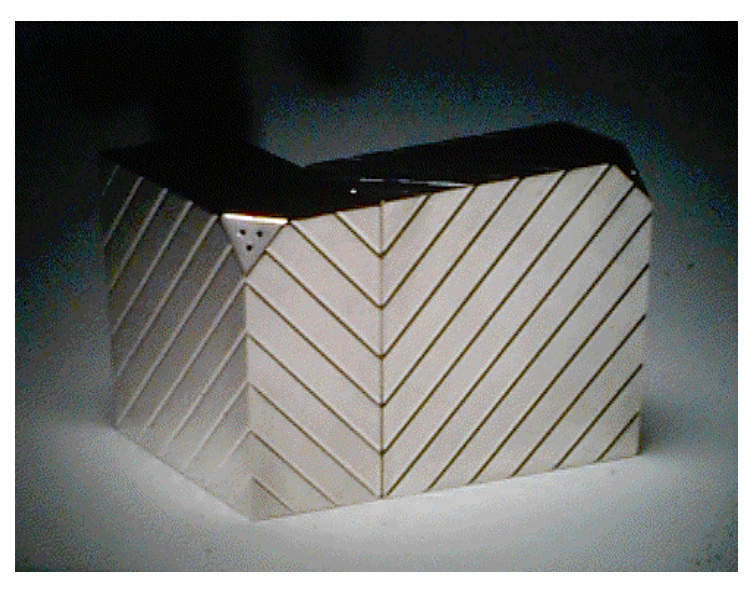
Straight lines applied to a salt and pepper set in a simple but imaginative way.

The following illustrations show some simple examples of the use of simple straight lines cut on commercial objects.