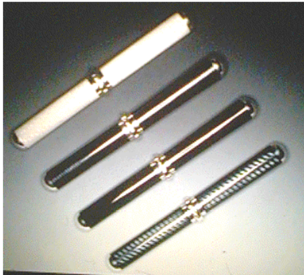
A group of recessed, engine turned and enamelled corkscrews, closed, with the corkscrew inside the handle