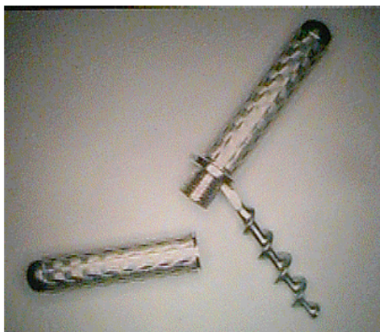
A similar corkscrew without enamel, open, ready for the half-handle to be screwed back on for use. The cuts follow along the tube, trimmed at the ends with a circular cut